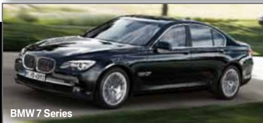
BMW 7 Series

Owning a BMW isn't only about hitting the road. It's also about getting the treatment you deserve. Enjoy superior service, benefits, and value with a BMW from Lauderdale BMW. Our well equipped models include no-cost maintenance, fuel efficient engines, and exhilarating performance. The BMW Exceptional Customer Service Commitment is our promise to bring you the superior service that's an essential part of your ultimate driving experience.