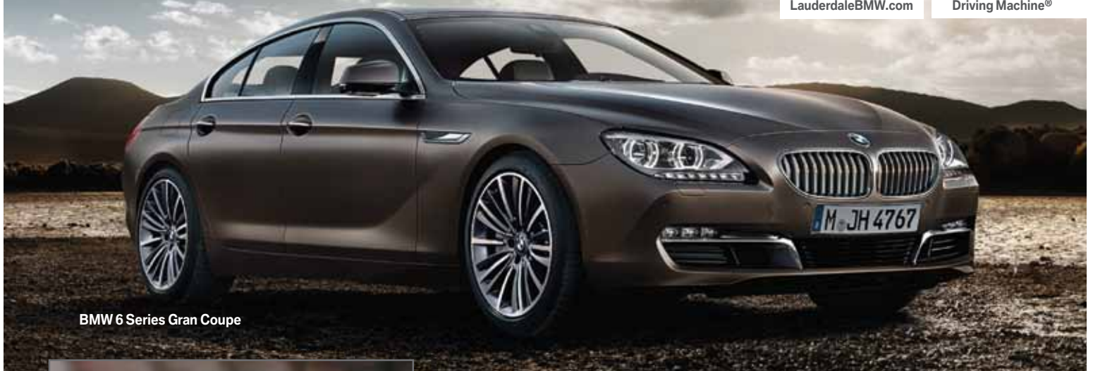
BMW 6 Series Gran Coupe