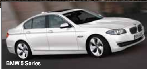
BMW 5 Series