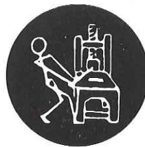
POINSETTIA PRESS 325 S.W. First Avenue Fort Lauderdale 463-0542