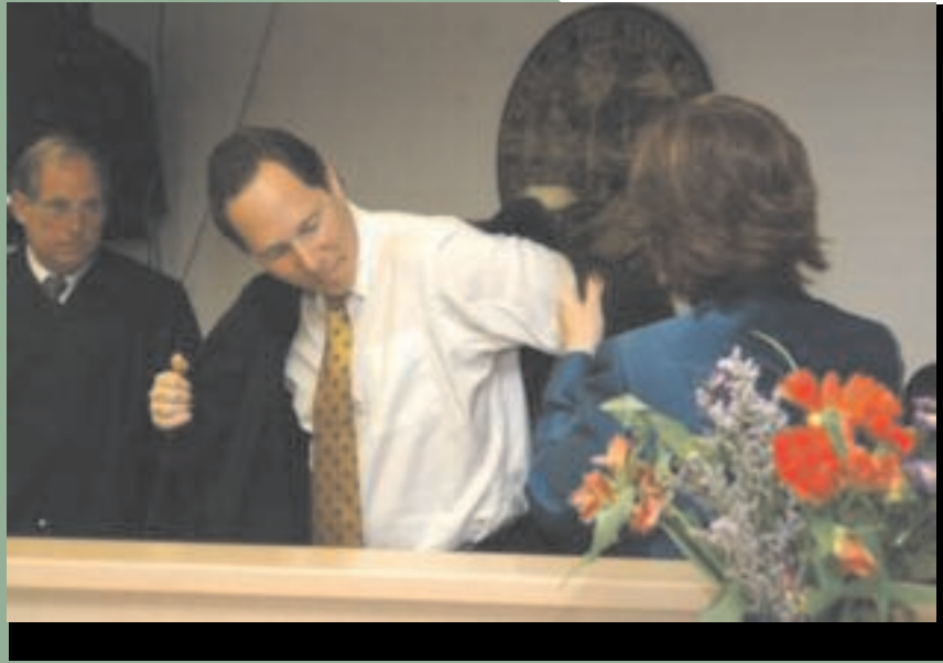
The Honorable Dale C. Cohen 17th Judicial Circuit Court