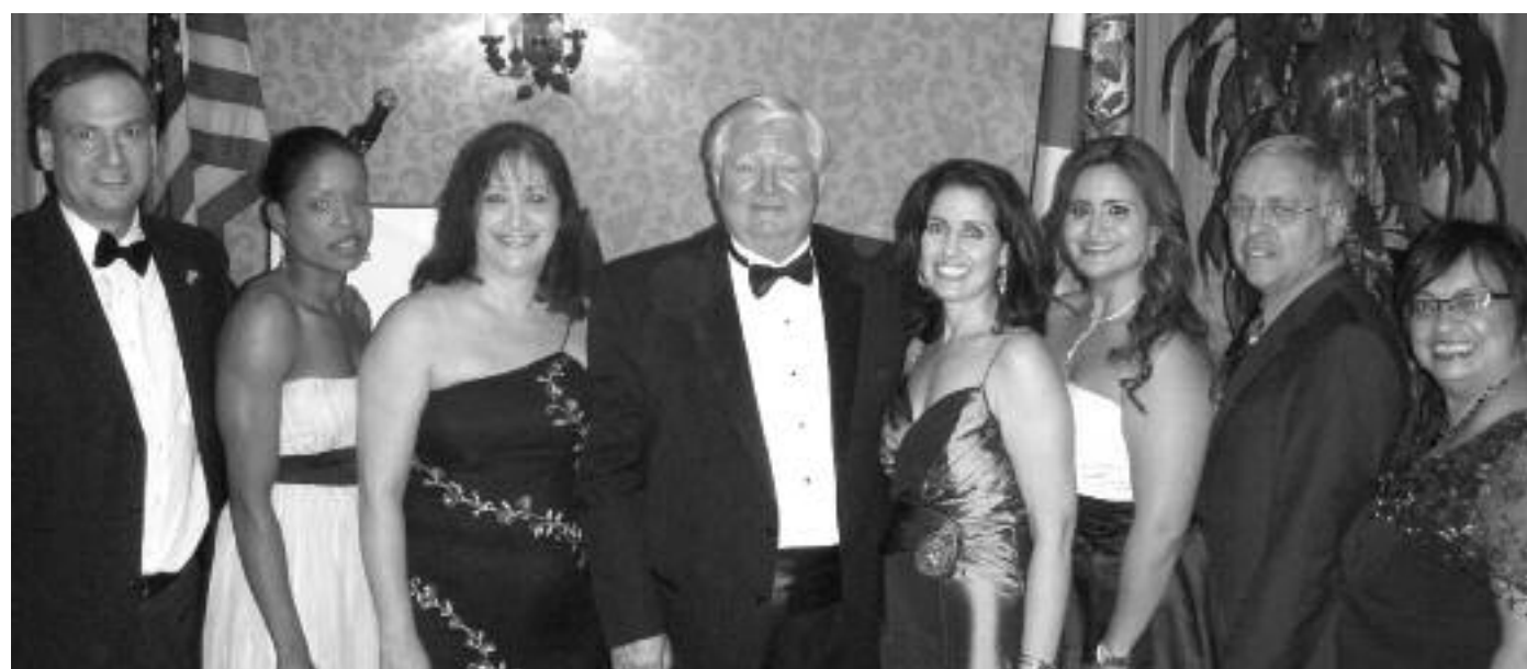
The Puerto Rican Bar Association of Florida Celebrated its Seventh Year, by Paying Tribute to Education and Launching a Scholarship Foundation Celebrating these accomplishments at the Seventh Annual Gala on Saturday, November 14, 2009 at 7:00 p.m. in Coral Gables, Florida:

Please join our efforts to make a difference for the children of Broward County.