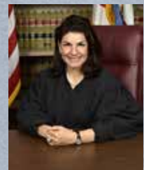
The Honorable Tarlika Navarro