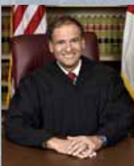
The Honorable Carlos S. Rebollo