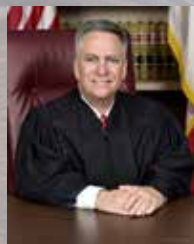
The Honorable Frank Ledee