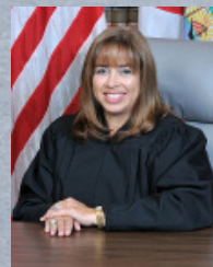
The Honorable Olga Levine